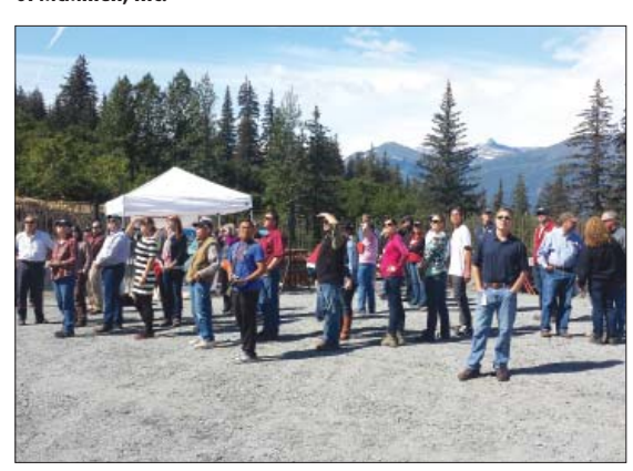
Kickoff guests viewing the layout of the project construction site