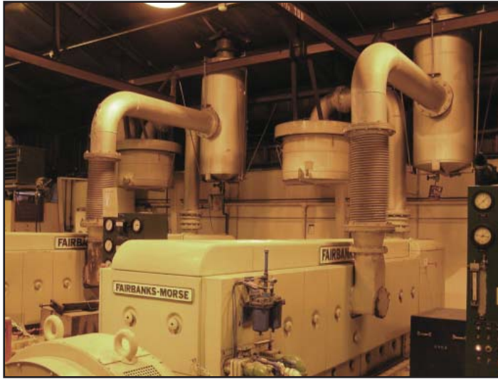
These Glennallen diesel plant dinosaurs, installed in 1959, will be replaced with a newer, more efficient engine in 2008.

In total, the Governor's office received more than 1,000 communications. CVEA believes this effort exemplified the Cooperative spirit and thanks everyone who participated.