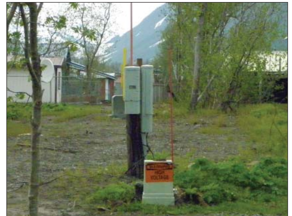
Above, two CVEA rights of way (ROW); the left has many objects in the ROW and might impede quick response if access is needed, the one on the right has been cleared as part of the ROW maintenance program