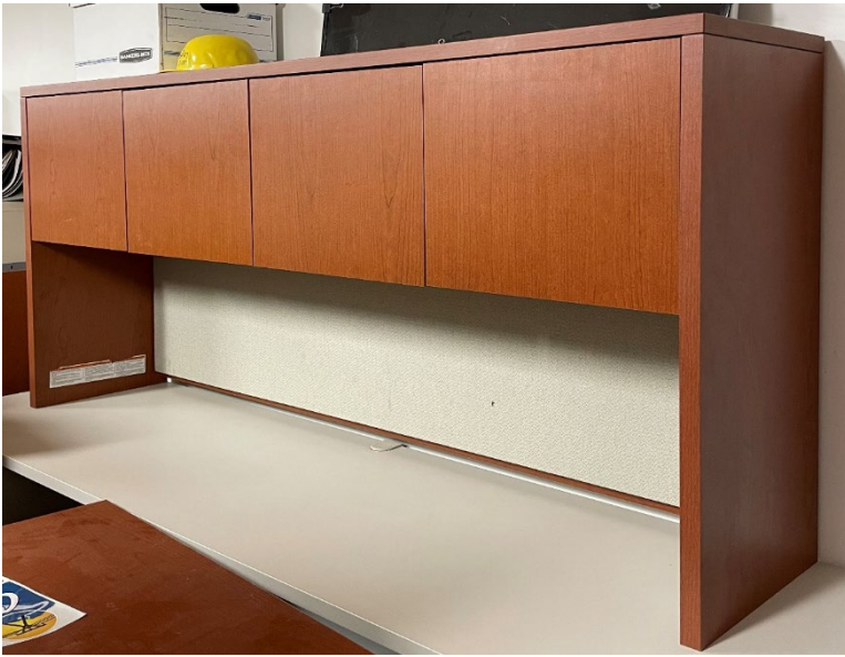
Desk Hutches – Quantity 5, Sold Separately Minimum Bid – None