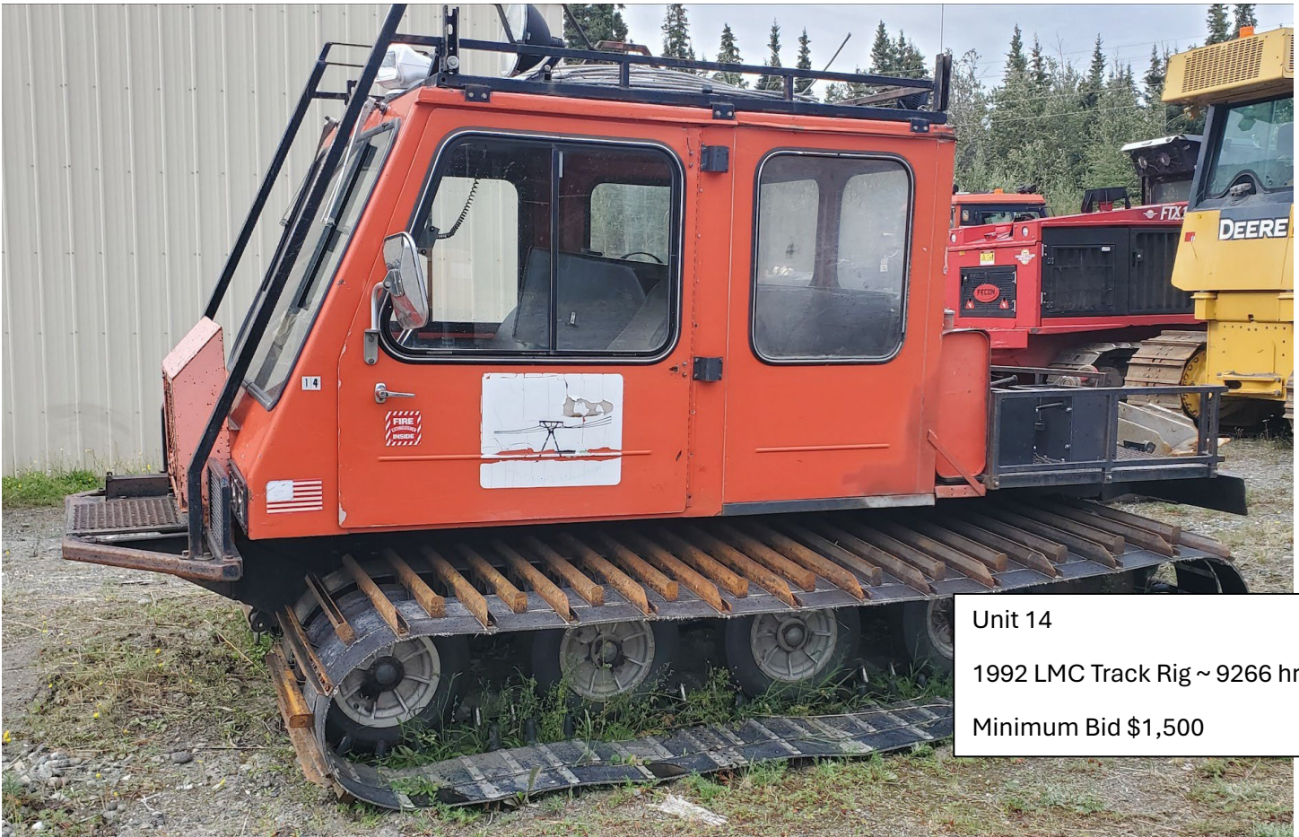
Unit 14 1992 LMC Track Rig ~ 9266 hrs Minimum Bid $1,500