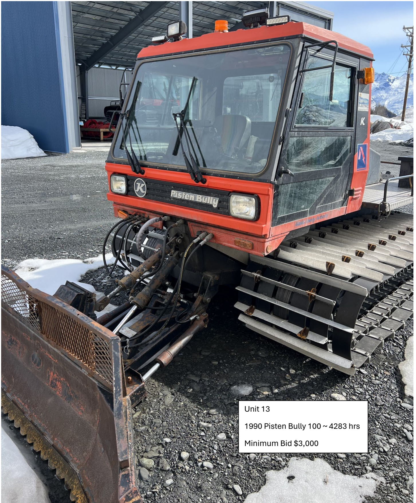
Unit 13 1990 Pisten Bully 100 ~ 4283 hrs Minimum Bid $3,000