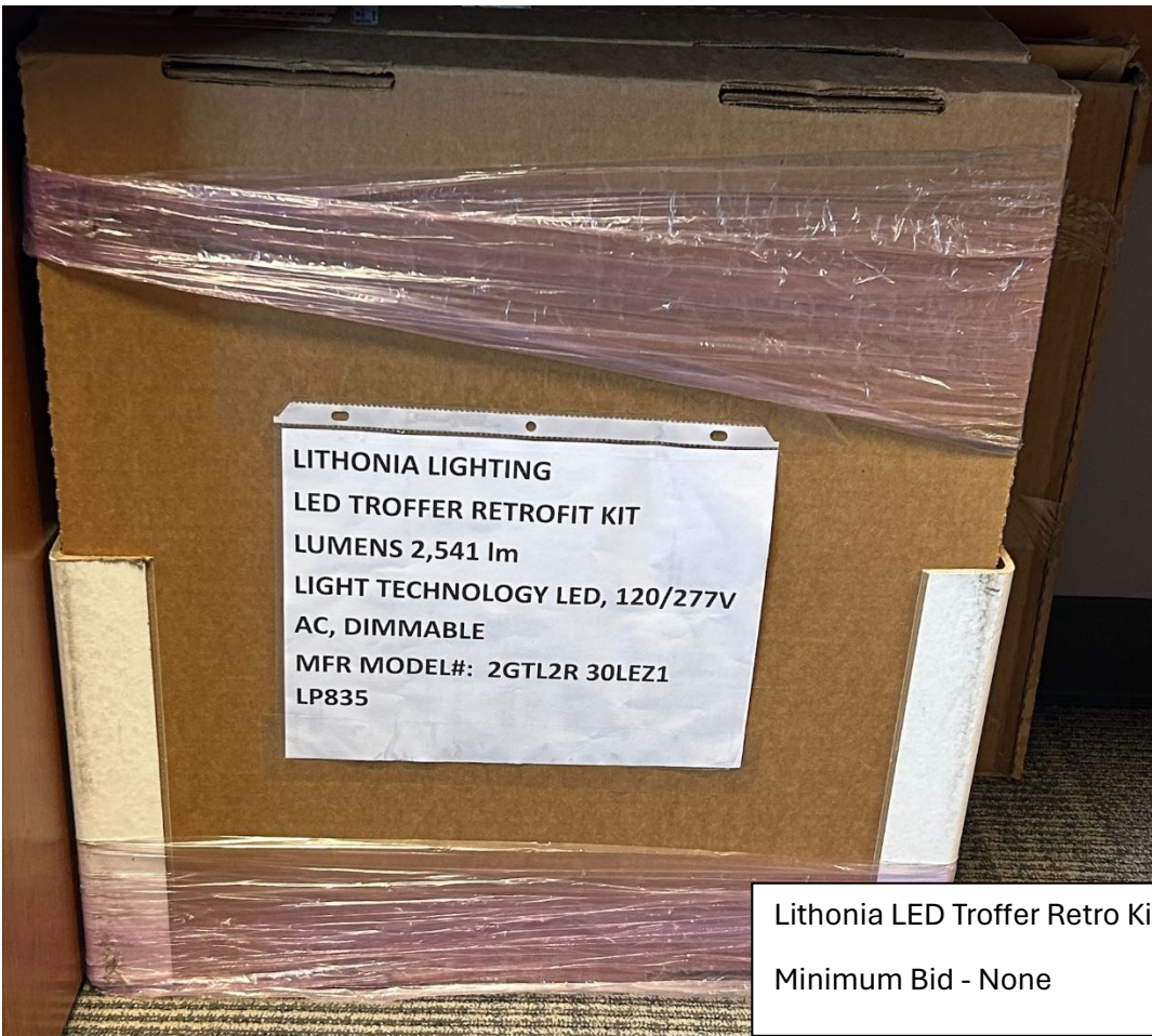
Lithonia LED Troffer Retro Kit Minimum Bid - None