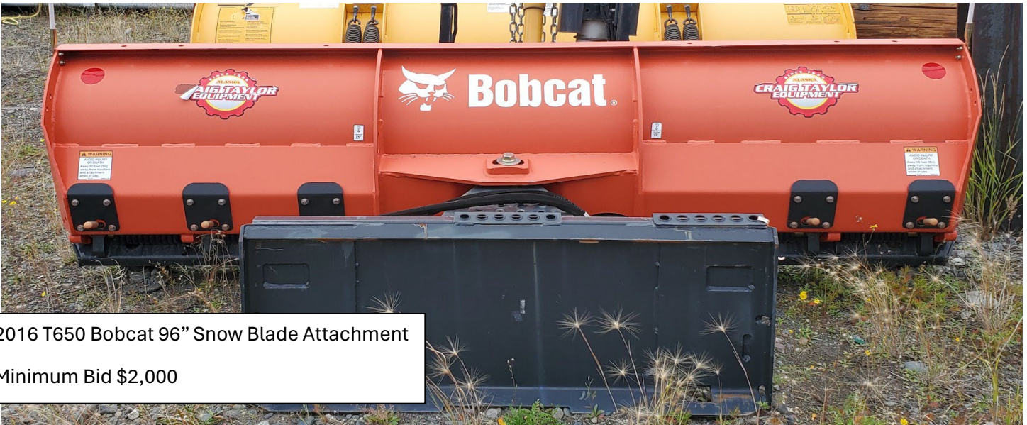
2016 T650 Bobcat 96" Snow Blade Attachment Minimum Bid $2,000