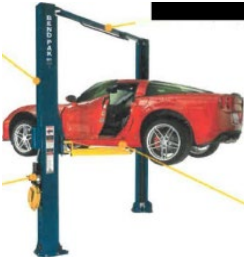
BendPak Asymmetric Lift – 10,000lb Minimum Bid $1,000