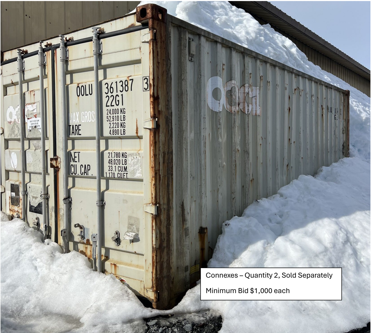
Connexes – Quantity 2, Sold Separately Minimum Bid $1,000 each