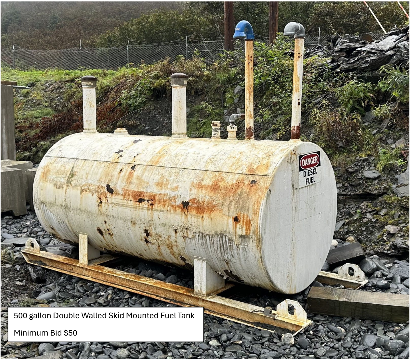
500 gallon Double Walled Skid Mounted Fuel Tank Minimum Bid $50